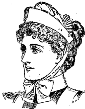
The New "Sister Dora" Cap. Made of washing Cambric, with draw strings. Can be washed as easily as a handkerchief. 1/-. Without strings, 10½d.