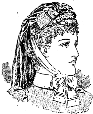
The "St. Bride's" Bonnet. Made of fine Straw with Lace and ruching, and trimmed with Ribbon, and long Silk Gossamer Fall. In black and colours, 12/6 each. Without Fall, 9/6; also The "St. Clare" Bonnet. 6/11 complete.